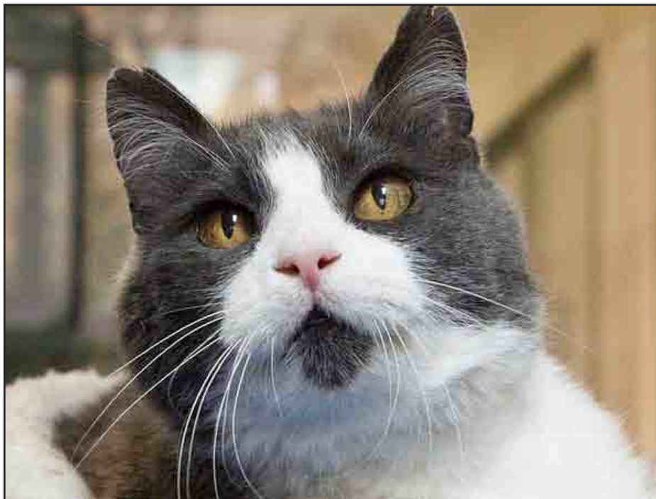
Anchor Blue, a handsome fourteen year old boy who is a long time resident of FIV Land.

Cats with FIV typically remain free of symptoms for many years. Eventually, infection can lead to a state of immune deficiency that makes the cat vulnerable