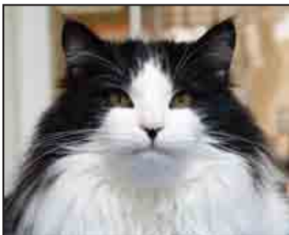
Owl Puccino, a former resident of FIV Land, now lives in a "Permanent Foster" home. His family will provide lifetime care for Owl, but he will continue to receive medical care and support from the Purrfect Pals veterinary staff.

In the later stages of FIV, a number of problems are possible, with inflammation