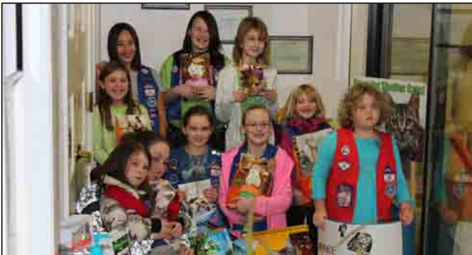
The "Cool Penguin Friends" Campfire Club dropping off donations of cat food and supplies which they collected at area grocery stores for Purrfect Pals.

Build-a-Bear Workshop's "Bear Hugs Foundation" for a much-needed $3,000 grant to help fund the Purrfect Pals Free Community Spay and Neuter Clinic.