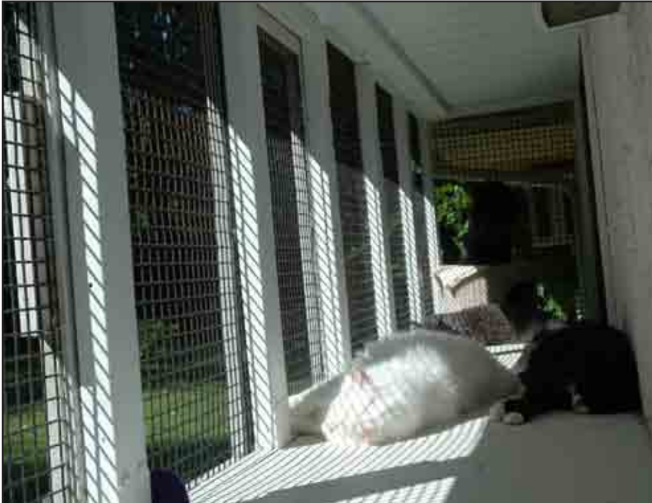
Rockstar, Jillian and Anchor Blue napping in the sun out in their window box.