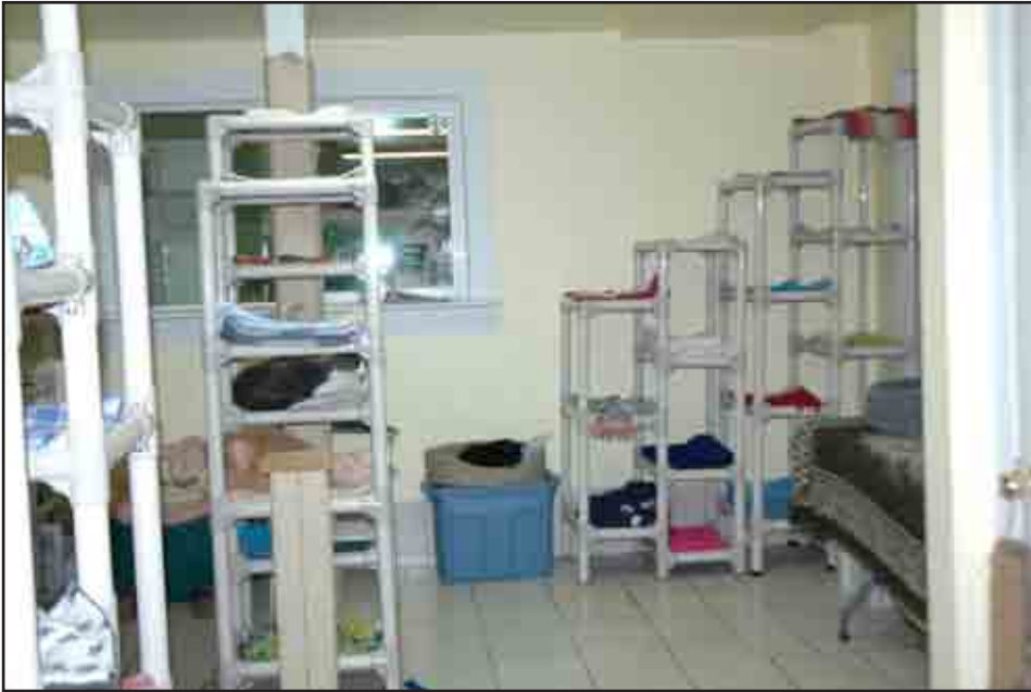
Just a few of the many Kuranda cat towers in FIV Land. The cats love climbing and sleeping on them and our staff and volunteers love that the towers are durable and easy to clean!