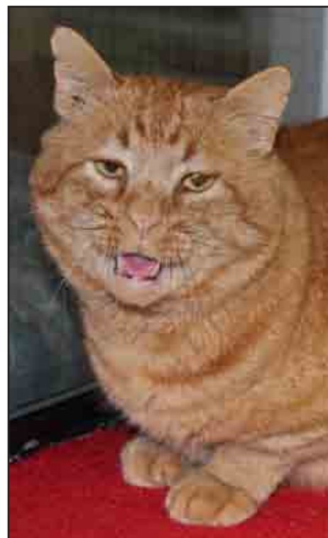
Leo, one of our newest FIV+ residents

hours to spare, please consider coming to spend it with the cats in FIV Land. Bedtime Bear, Tim Gunn, Cedric, Gage, Wagner, Jillian and Zackary have the feather toy ready and are looking forward to your visit! 🐾