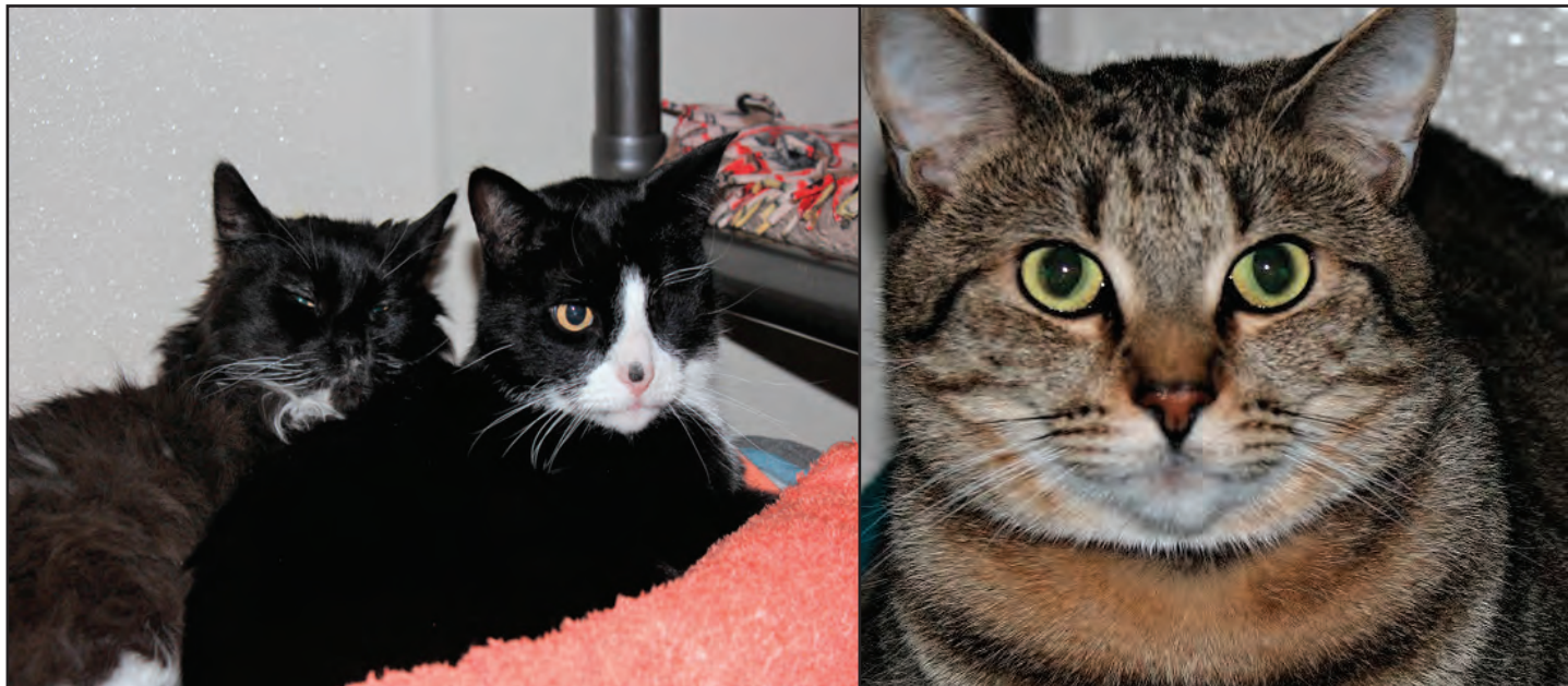
Left: Tessa and her best friend Tock; Right: Theodore, Tessa's newest companion.