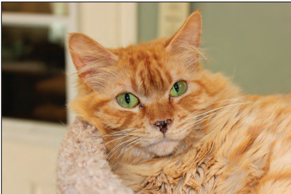
Ginger beauty Tandy and her "glowing" green eyes.

We found the perfect outlet for Tandy to let out her energy and that was our Cat Exercise Wheel! The staff would hold out a treat or toy to encourage