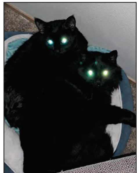
Cello (top left) - now aptly named "Spooky" - is bonded to her new brother Shadow.

Are you interested in adopting a cat like Cello? Contact Jessica at adopt@purrfectpals.org to learn about other shy cats looking for a patient human to help them heal.