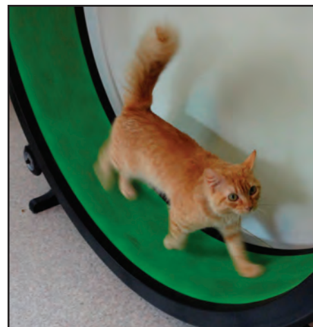
Tandy is an orange blur as she works out on her exercise wheel.