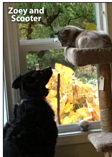
Zoey and Scooter

We brought home two FIV+ chunks, Alice and Coliver, last week and wanted to send an update on these babies, because I know how much everyone loves them there. The first couple of days, Coliver mostly slept in his window bed. He must have just been feeling a little crummy from his shots, though, because now he owns the place. He emerged from the bedroom, strolled over to the German Shepard, sniffed noses with him and head bumped him and strolled right on by with his tail in the air. Alice is obviously more timid and insecure without front claws, but she's made friends with the little dog. If the big dog could calm down a little she would be more apt to like him too. Coliver's