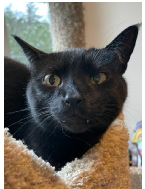
Six-year-old house panther Merlin (formerly Blackjack) shows off his vam-purr teeth :)

Merlin loves his double-stacked cat bed!