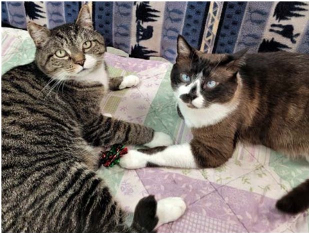
FIV Besties Firefly (left) & Carson (right) need a forever home!

A good samaritan found three-year-old tabby Firefly living outside their home and took him to their veterinarian to get neutered in the hopes of making him part of their indoor cat family. While under-going routine blood tests, Firefly tested positive for Feline Immunodeficiency Virus (FIV), so they unfortunately couldn't keep him and risk passing on the virus to their other cats.